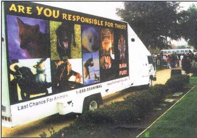
LCA's mobile billboard turned heads and stopped traffic as it toured Beverly Hills for ten hours.

LCA extends appreciation to Street Blimps for taking our message to the streets and to the Beverly Hills Police Department for professional courtesies extended to activists.