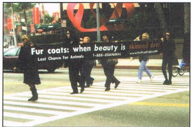
Activists took to the streets to spread the message.

More than one hundred activists marched through the ritzy Rodeo Drive shopping district on their way to Neiman Marcus for an extended protest. If the two-block line of activists didn't get attention, LCA's mobile billboard certainly didn't go unnoticed by anyone shopping in Beverly Hills. Portraying the "before" and "after" pictures of animals killed by the cruel fur industry, the truck-mounted signs circled Beverly Hills' shopping district for 10 hours.