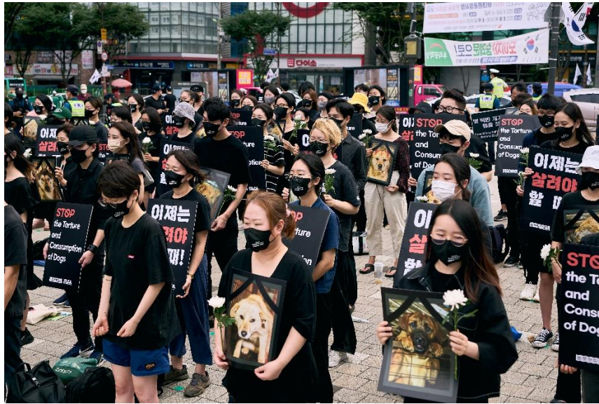
August 2022 Boknal Protest Moran Market